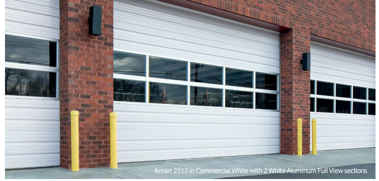
Amarr 2512 in Commercial White with 2 White Aluminum Full View sections

An industry workhorse and our most versatile commercial doors. The Amarr open-back, 2" ribbed panel commercial steel doors are available in a variety of steel gauges and feature tongue and groove construction with a bottom weather seal to guard against the elements. These doors can be factory or field modified with HCFC-free polystyrene insulation to fit the needed application.