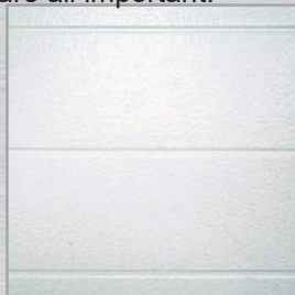
Ribbed Panel Design

Panels are pre-painted inside and out to inhibit rust. Hot-dipped, galvanized steel is painted with primer and given a tough oven-baked polyester top coat, to provide the most rust-resistant steel door available. Ten year warranty against rust-through.