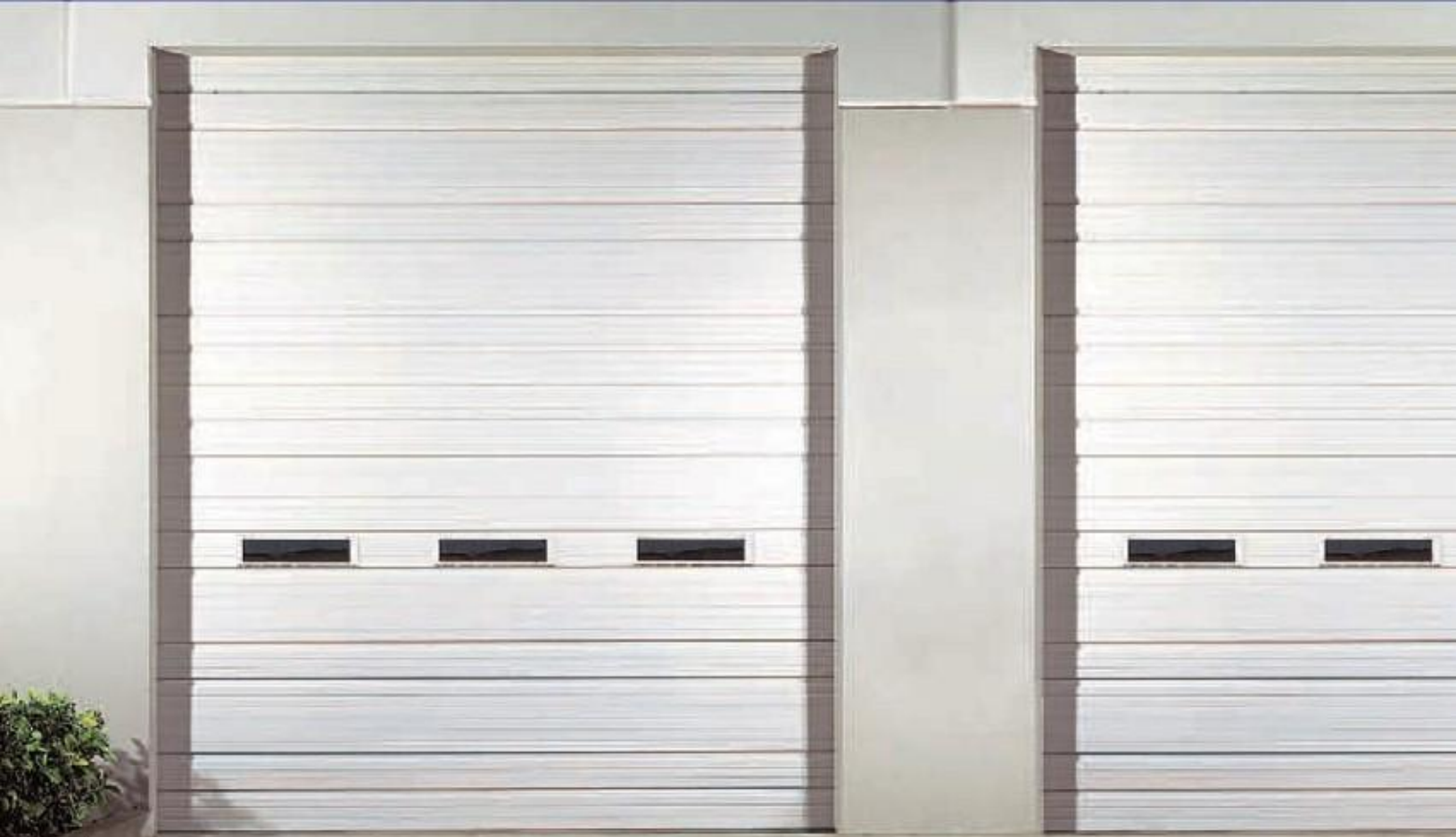
Model 524 with 24" x 6" Lites