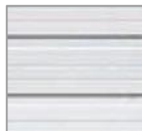
Ribbed Panel Design